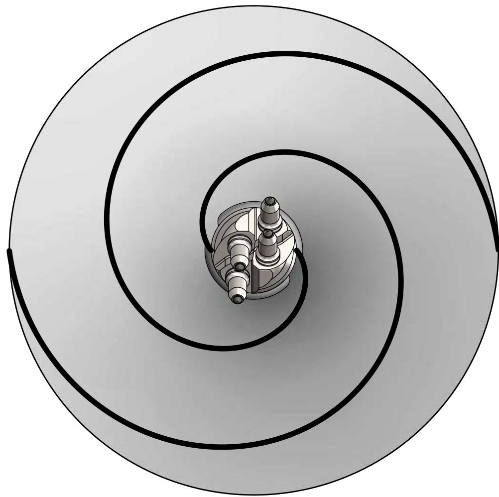
Stage I - 360°