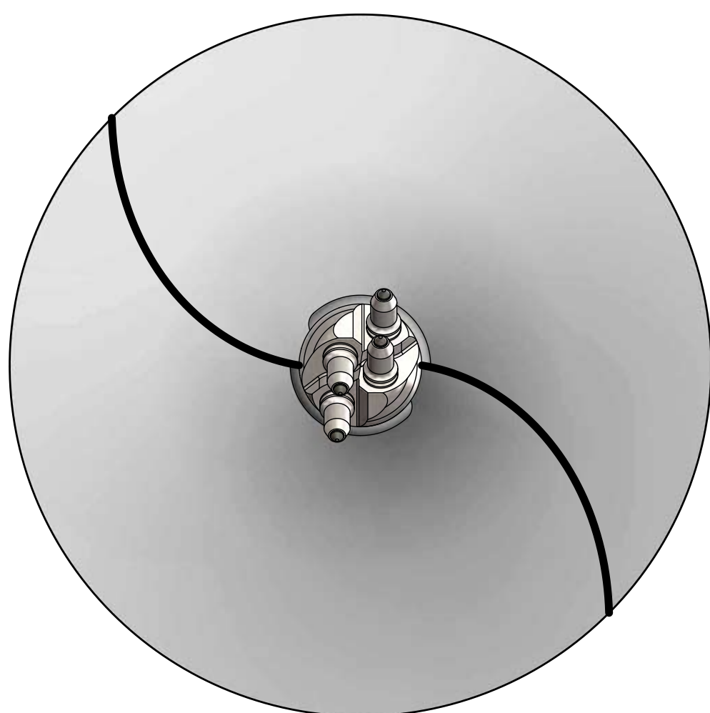
Stage V - 45°