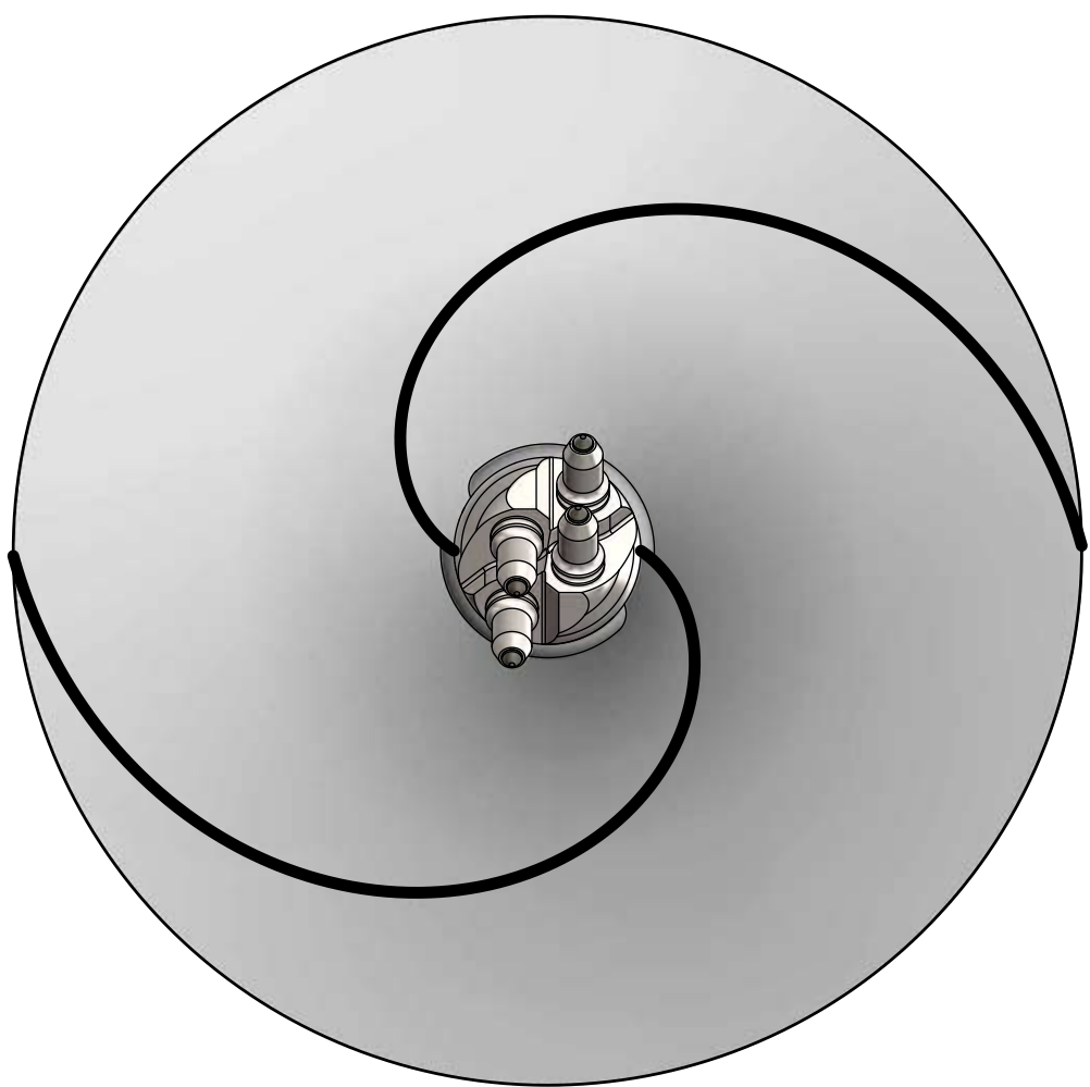
Stage III - 180°