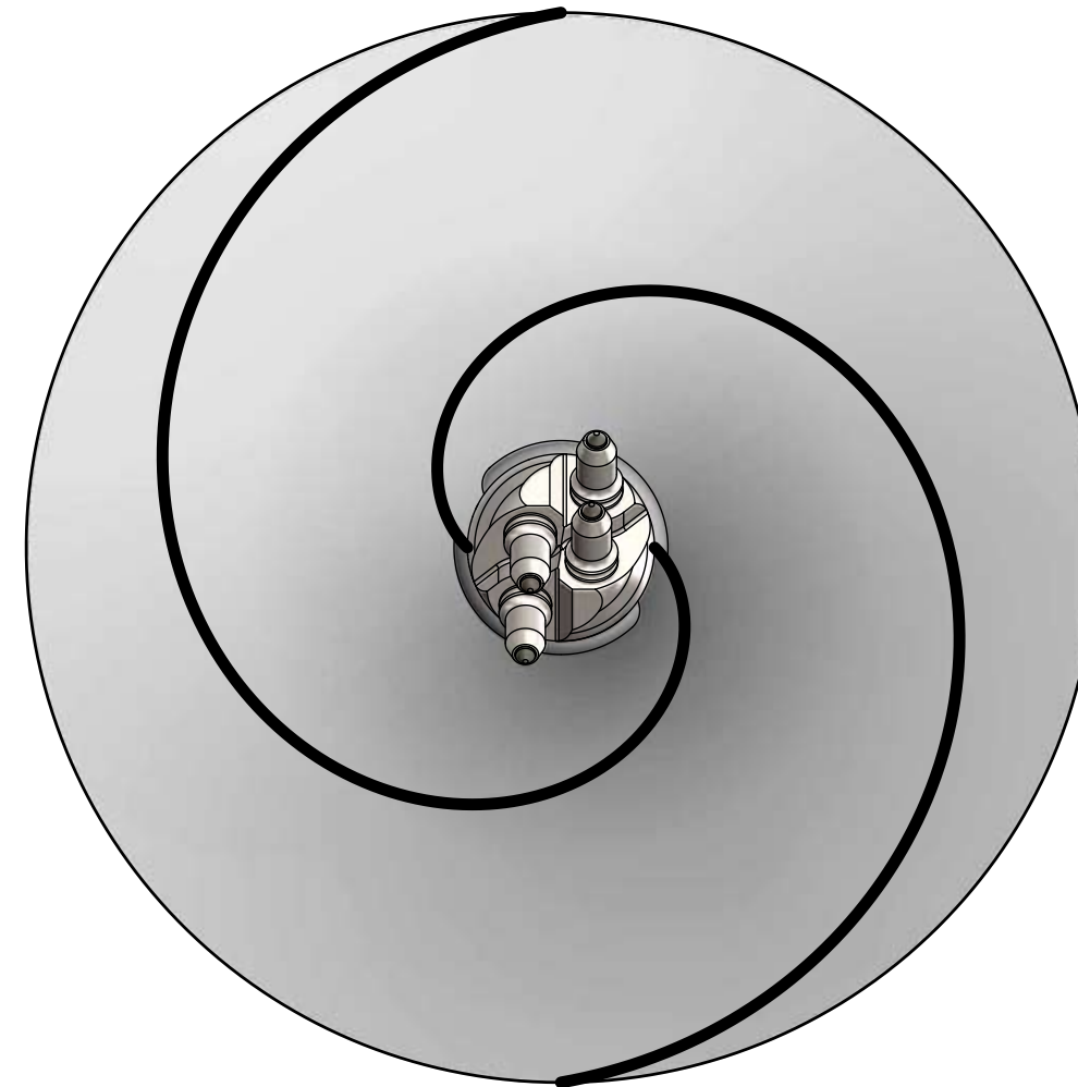
Stage II - 270°